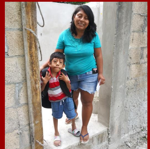
Partners for Medical Relief-501C3

Make a difference... one life at a time.